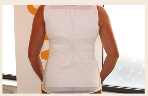
3. The dressing is in place.

Make one cut on each side of a tube gauze to make holes for the arms. Thread on the tube gauze as a sweater over the dressing.