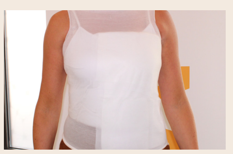
3. The dressing is in place.

2. Make one cut on each side of a tube gauze to make holes for the arms. Thread on the tube gauze as a sweater over the dressing.