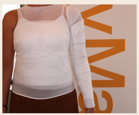
3. The dressing is in place.