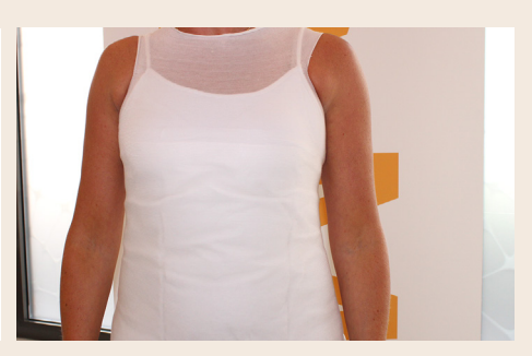
3. The dressing is in place.

Make one cut on each side of a tube gauze to make holes for the arms. Thread on the tube gauze as a sweater over the dressing.