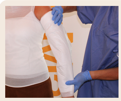
1. Place the dressing around the arm so that the wound area is covered.